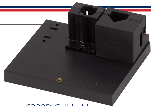
6320D Cell holder